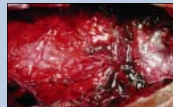
35 Days Post Op